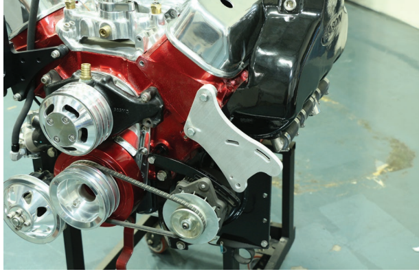
Install 1/4" spacer washer taper side towards the saginaw pump.

Attach the bracket to the port cylinder head with the 2 spacers towards the head.