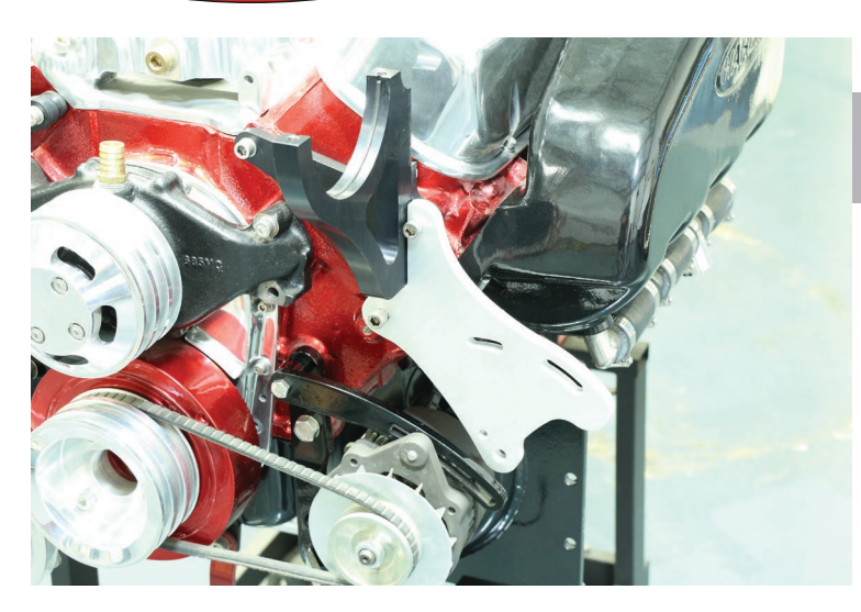
Install 1/4" spacer washer taper side towards the saginaw pump.