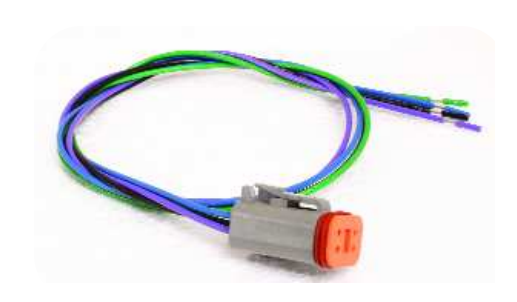
Part # DCH Four pin connector & wire harness

for use on Mega & Race Series Electric gauges & Tachometers